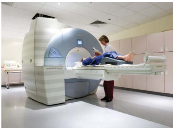
Siemens Avanto 1.5T MRI Scanner

Although the scanner is open at both ends, some people may find this claustrophobic.